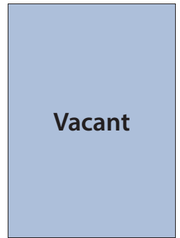
Vacant District ES-10