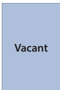
Vacant District R-6