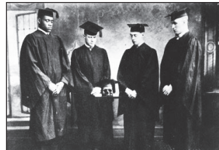
Paul Robeson, far left.