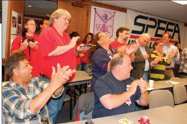
Thousands of SPEEA members walk around the Everett Boeing factory in support of their negotiating team. At left, a standing ovation for the vote results announced Oct. 1, when members resoundingly rejected Boeing's contract offers. About 40 helped with the vote count, including Council Reps and Area Reps. Negotiation Team members were observers.