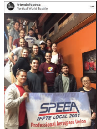
An online advertisement featured SPEEA members at a union event.

Non-union aerospace professionals who are not in management roles are welcome to become a Friend of SPEEA.