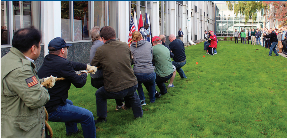
Military veterans working at Boeing's Developmental Center, including a few SPEEA members, are shown here in one of the three friendly tug-of-war matches, Nov. 12.