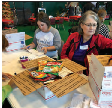
Volunteers help package 'Christmas in a Box' for Kansas military members serving overseas.

members and retirees volunteered to collect donations Nov. 30. About 200