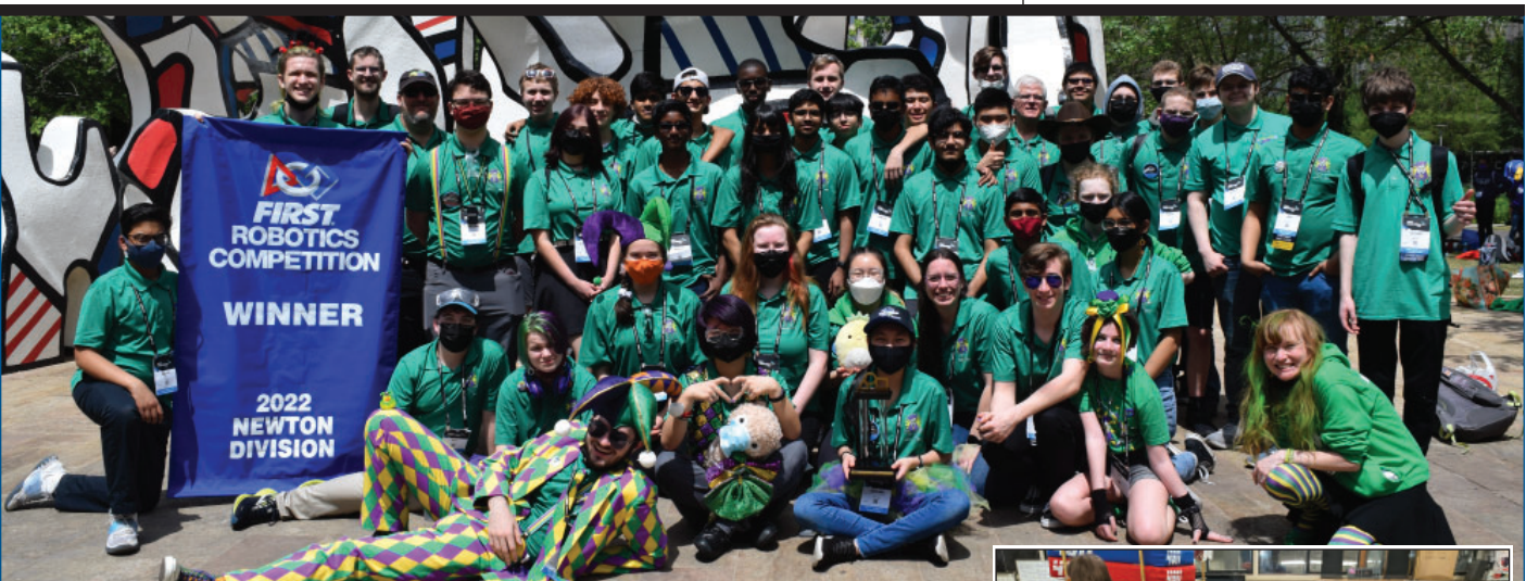
Shown above are Jack in the Bot team members with the FIRST championship banner and award. With other teams, Jack in the Bot formed an alliance that won its division, one of six total at the championship.